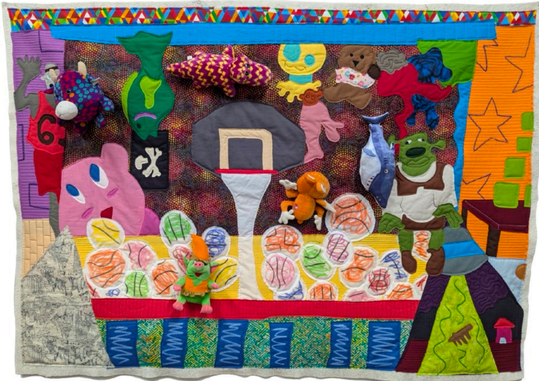
Michael C. Thorpe Aura of Authenticity , 2024 Fabric, batting, thread, crayon and stuffed animals 43.5 x 60 in